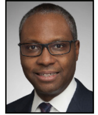
Superior Court Judge Seat 13 Patrick Thompson