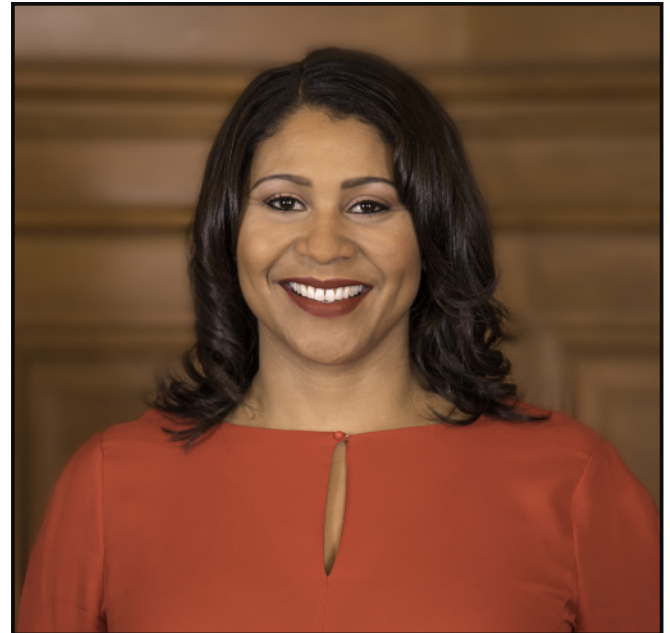
Mayor London Breed