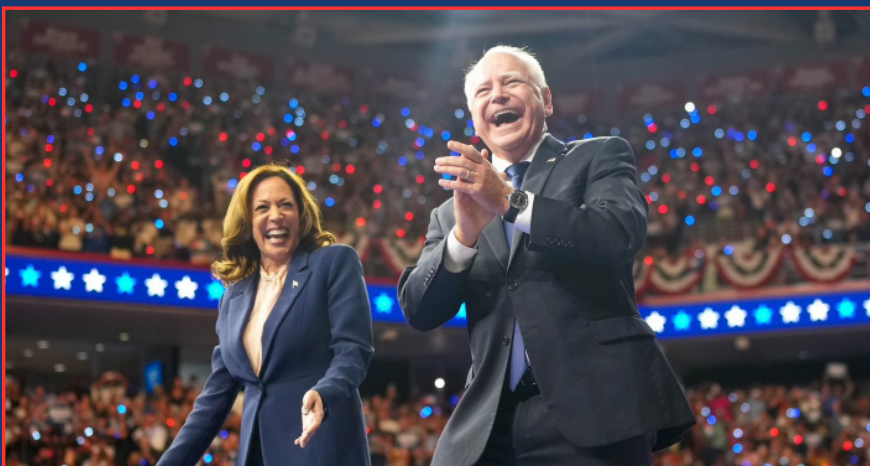
President of the United States of America