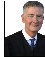
Superior Court Judge Seat 1 Michael Isaku Begert