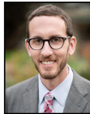
State Senate District 11 Scott Wiener