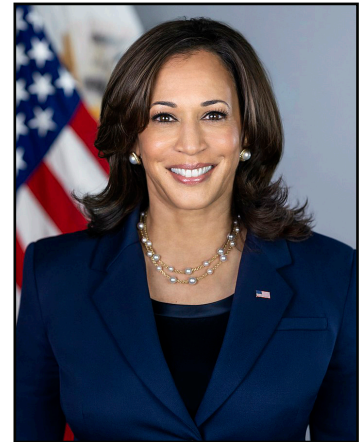
Vice President of the United States of America Kamala Harris