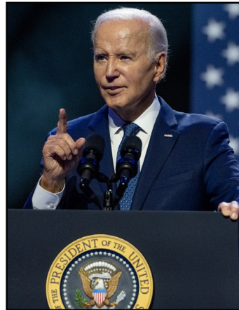
President of the United States of America Joe Biden

Please vote for these union-endorsed candidates. We urge you to vote, and vote Union!