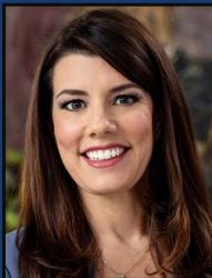
State Assembly District 19 Catherine Stefani