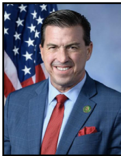
U.S. Congressional District 15 Kevin Mullin